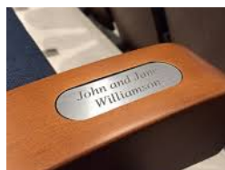
EXAMPLE ONLY. Actual style, color and font type and/or size may vary.

ManeStage Theatre has the right to reject any seat name where the proposed text for the engraved plaque contains unacceptable language and/or does not abide to ManeStage Theatre's standards.